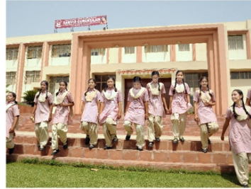
Samvid Gurukulam: A 3 floor CBSE affiliated Sr. Secondary School