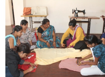
Samvid Expert School: In house vocational training & cottage industry for women