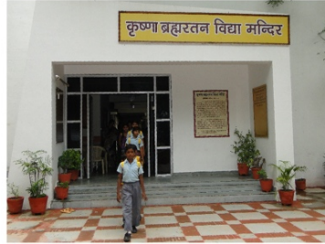
Krishna Brahma Ratan Vidya Mandir: A Primary School for community children