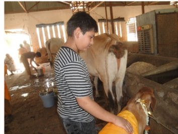
Cow Barn (Gau Shala): Clean & well maintained shelter for cows