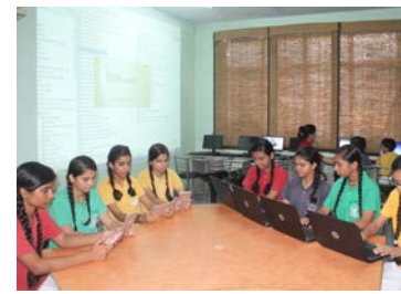
ST Micro Computer Lab: A computer lab to impart basic computer literacy to the community youth