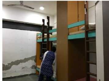
Girls Hostel: Residential complex for the girls of Samvid Gurukulam