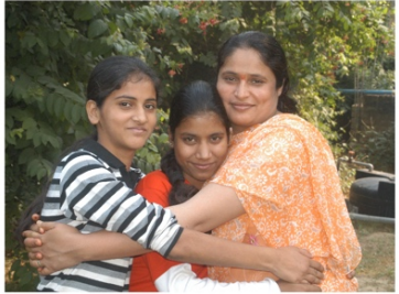
Gokulam: Residential complex for the members