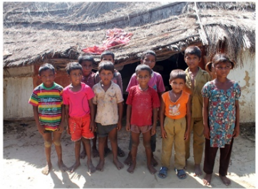
VasukiShreyam: Rehabilitation of marginalized children of Snake Charmers community