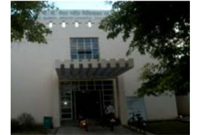
GD Bansal Swasti Hospital: Allopathic Hospital with all the facilities & in house pharmacy