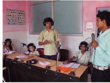
Vaishishtyam: Center for children with special needs & disabilities