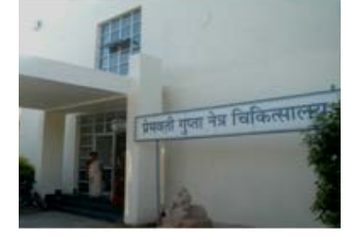
Premvati Gupta Eye Hospital: Dedicated Ophthalmology Centre to perform Cataract and Glaucoma surgeries